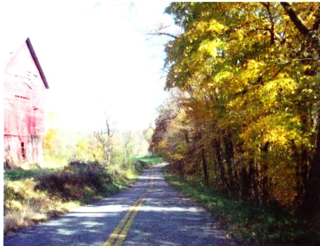
This safety message brought to you by Holmes County Safe Communities